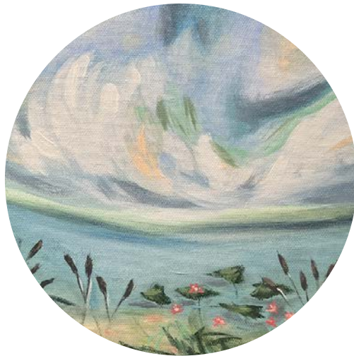
'LILY PAD COVE'

Maybe it's silly but for me rolling fields of hay can be so pretty especially at a certain time of day. When the sun is hitting the horizon and bouncing it's first or final rays into the day.